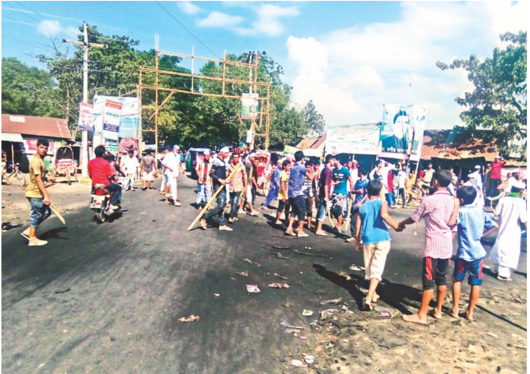
People armed with sticks and sharp weapons at College Mor in Nasirnagar. A rally was held there to protest a Facebook post allegedly demeaning Islam. At least five Hindu temples and about 100 homes were vandalised just 250 metres away.