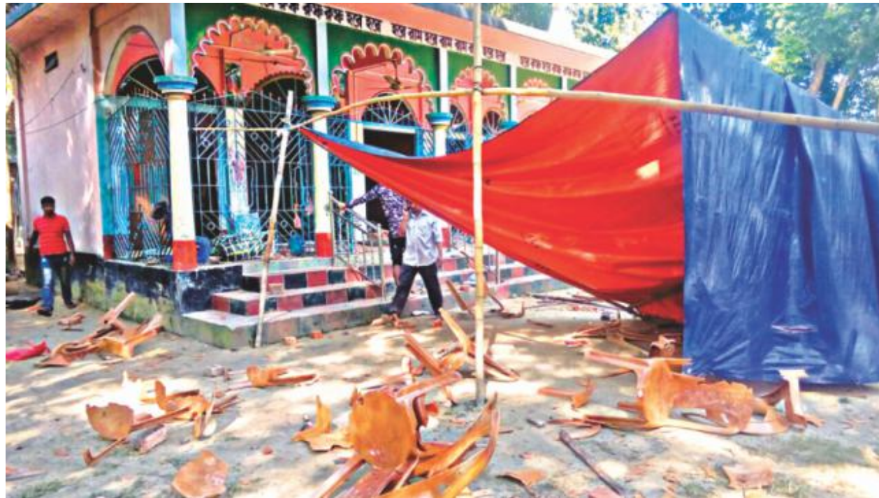
One of the vandalised Hindu temples in Nasirnagar upazila of Brahmanbaria.

Around a hundred houses, 5 Hindu temples vandalised, dozens injured in attack by religious zealots over a Facebook post